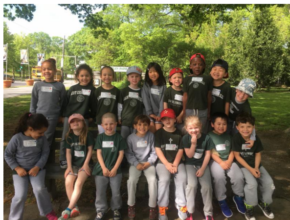
K1 visited the Franklin Park Zoo.

Friday, May 26th will be a Spirit Day fundraiser for the Cystic Fibrosis Foundation. Students who bring a donation may dress out of uniform. Cystic Fibrosis is a debilitating genetic disease that primarily affects the lungs, but over time can have profound effects on other body systems as well. The CF Foundation provides much of the funding for research into new drugs and towards a cure.