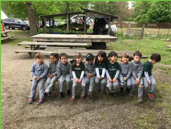
PreK visited the farm this week!