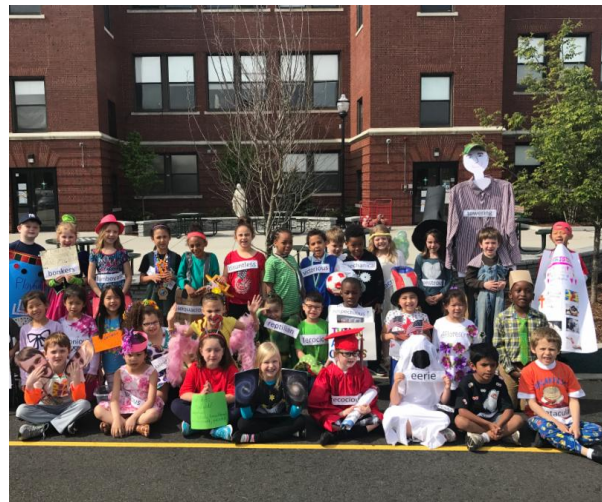
Grade 1 students celebrate Vocabulary Day.