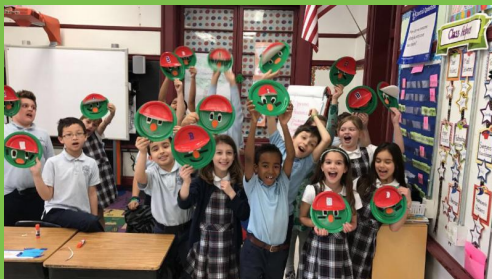
Grade 3 students celebrating opening day of the Red Sox!

Pasta Supper - April 28th 5:30 pm and 6:30 pm