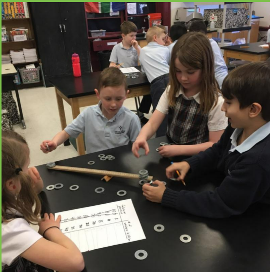
Grade 2 students built levers to discover how to lift a load using less force.